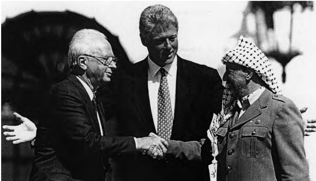
President Clinton with Rabin and Arafat after the signing of the Israeli-PLO peace accord, September 1993.

21 Study the photograph, and then answer the questions which follow.