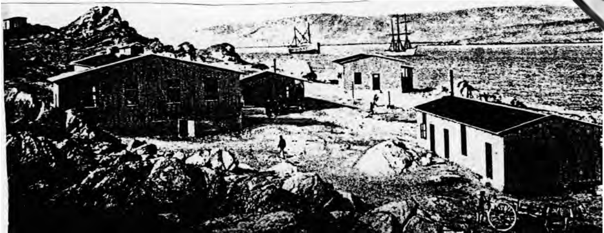
An early German trading post.

19 Study the picture, and then answer the questions which follow.