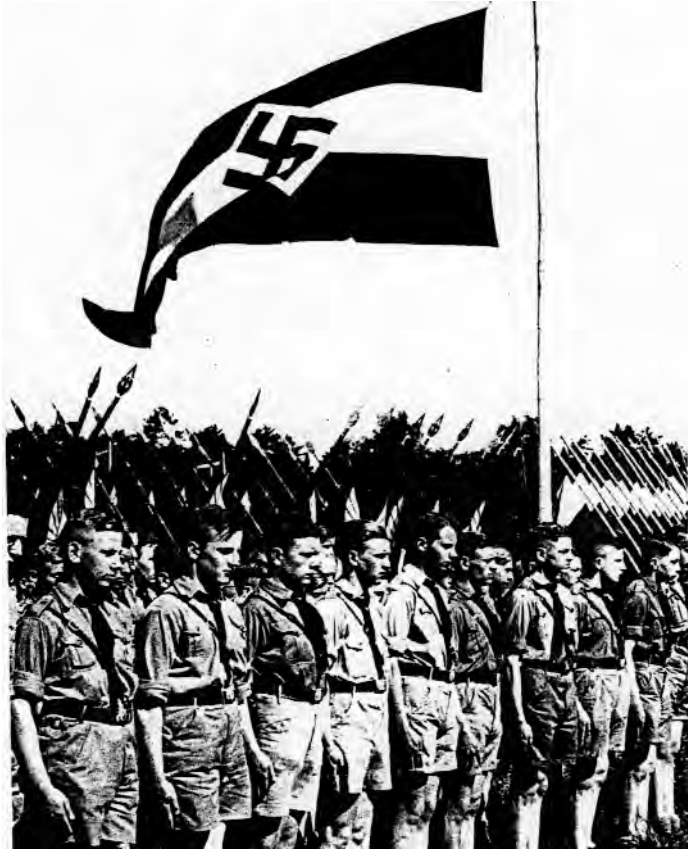
Members of the Hitler Youth on parade.

10 Study the photograph, and then answer the questions which follow.