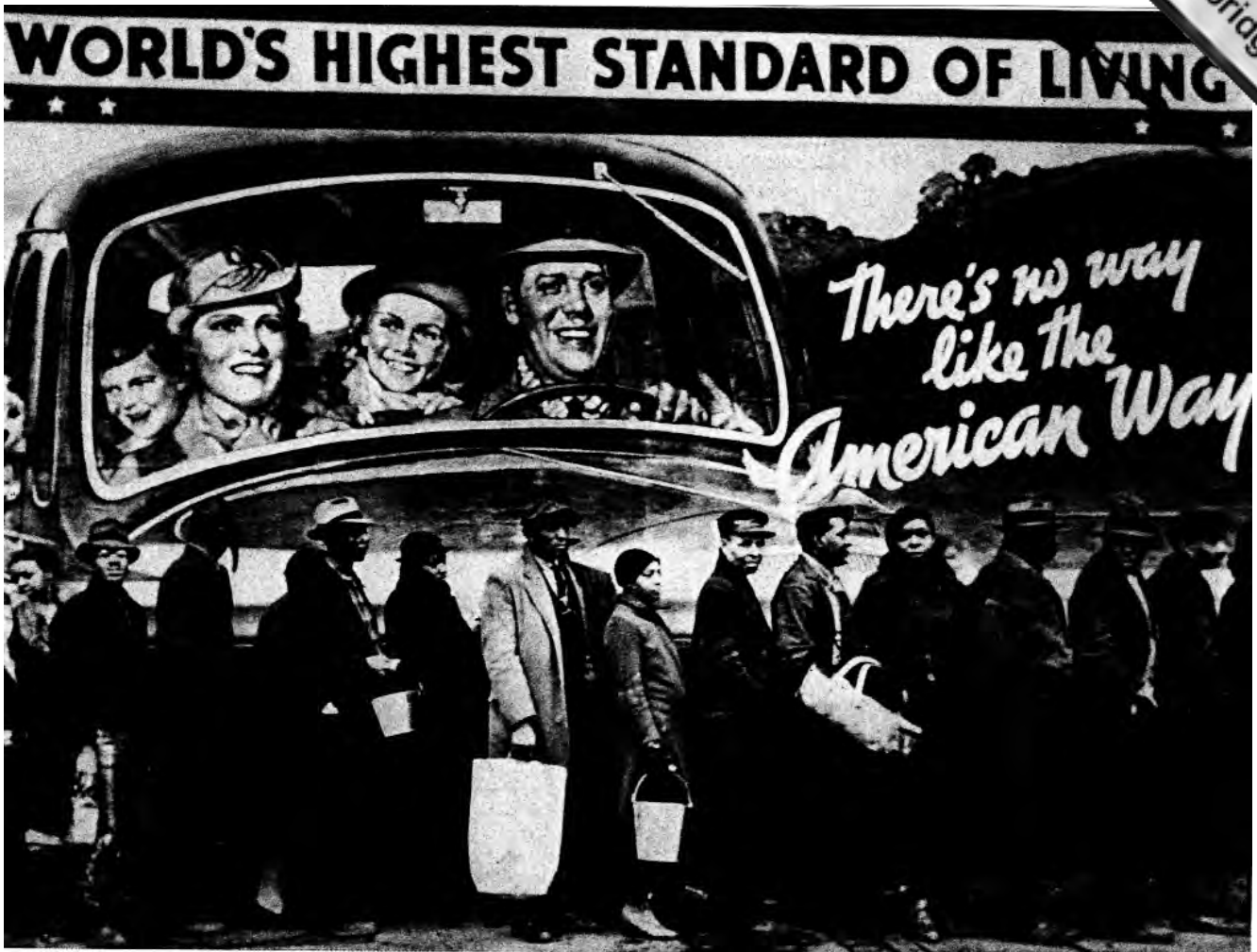
Unemployed people queuing for government relief in 1937.

14 Study the photograph, and then answer the questions which follow.