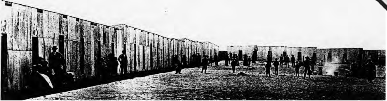
A concentration camp for Boers.

17 Study the photograph, and then answer the questions which follow.