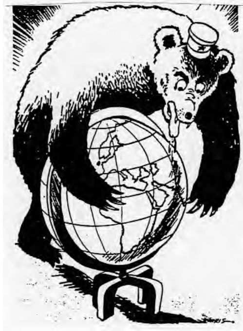
An American cartoon from the late 1940s. The bear represents the USSR.